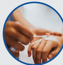
New cancer treatments