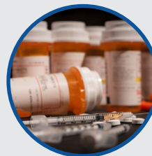
Addiction treatment programs